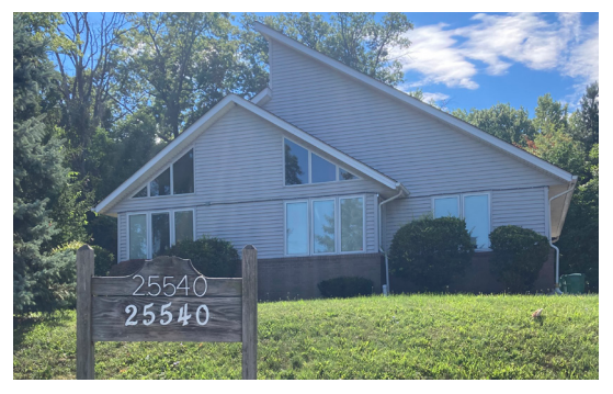
Roberto Flores Home, located in Euclid, OH.

Two new residential treatment facilities are also slated to open in 2023: C.H. Everett Clinic in Mentor and ORCA House in Cleveland.