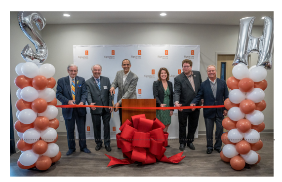
In early May, a ribbon cutting ceremony was held to celebrate the new Painesville space.

Since opening its doors, Painesville patients have enjoyed the space for counseling, psychiatry, primary care, infectious disease care, lab services, and filling prescriptions at our new, on-site pharmacy. Next up: launching dental services and a Medication Assisted Treatment (MAT) program in 2023.