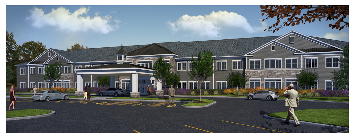
A rendering of the new Willoughby location.

We were excited to break ground in 2022 on our larger, much-anticipated Willoughby health center, which is expected to open in late 2023. The new building located on Mentor Avenue will support integrated care and positive experiences for both patients and colleagues.