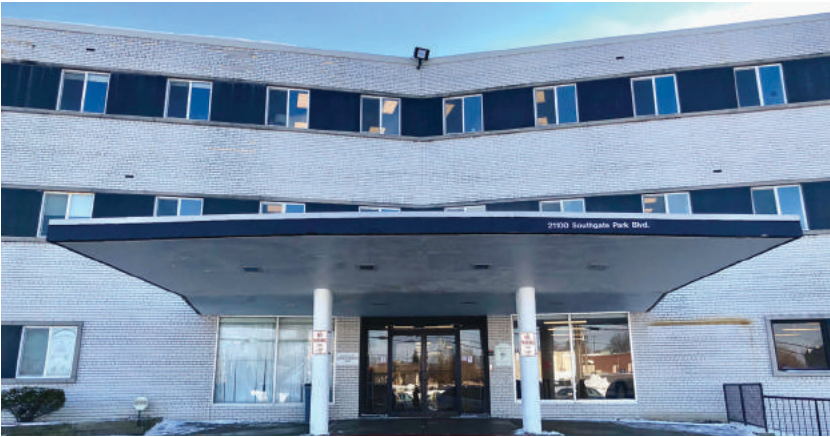
New Maple Heights Office