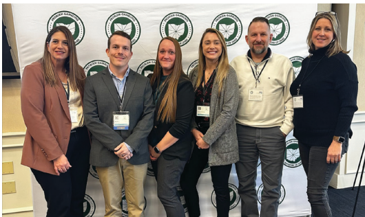
Some of Signature Health's counselors who specialize in Problem Gambling Disorder.

We now have over 20 clinicians across six sites who have completed training to specialize in gambling disorders. We've also begun screening patients for gambling disorders during the diagnostic assessment process and in IOP groups to get them the help they need.