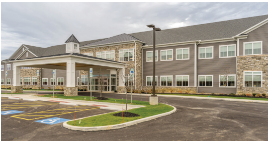
The new Signature Health Willoughby is located at 38876 Mentor Ave.

Over 300 employees and community partners came together during an Open House Ribbon Cutting Ceremony in early November to celebrate the opening of the building.