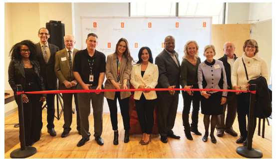
Members of the Signature Health Residential Team cut the ribbon for the C.H. Everett Clinic in December 2023.