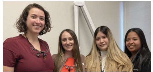
Signature Health's Painesville Dental Team

We're excited to announce that the dental clinic opened in February 2024 and has been providing preventative and minimally invasive care to established Signature Health patients.